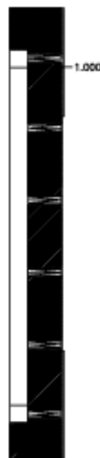
Top View of Part

Make measurements from datum A and from a line from this corner perpendicular to it.